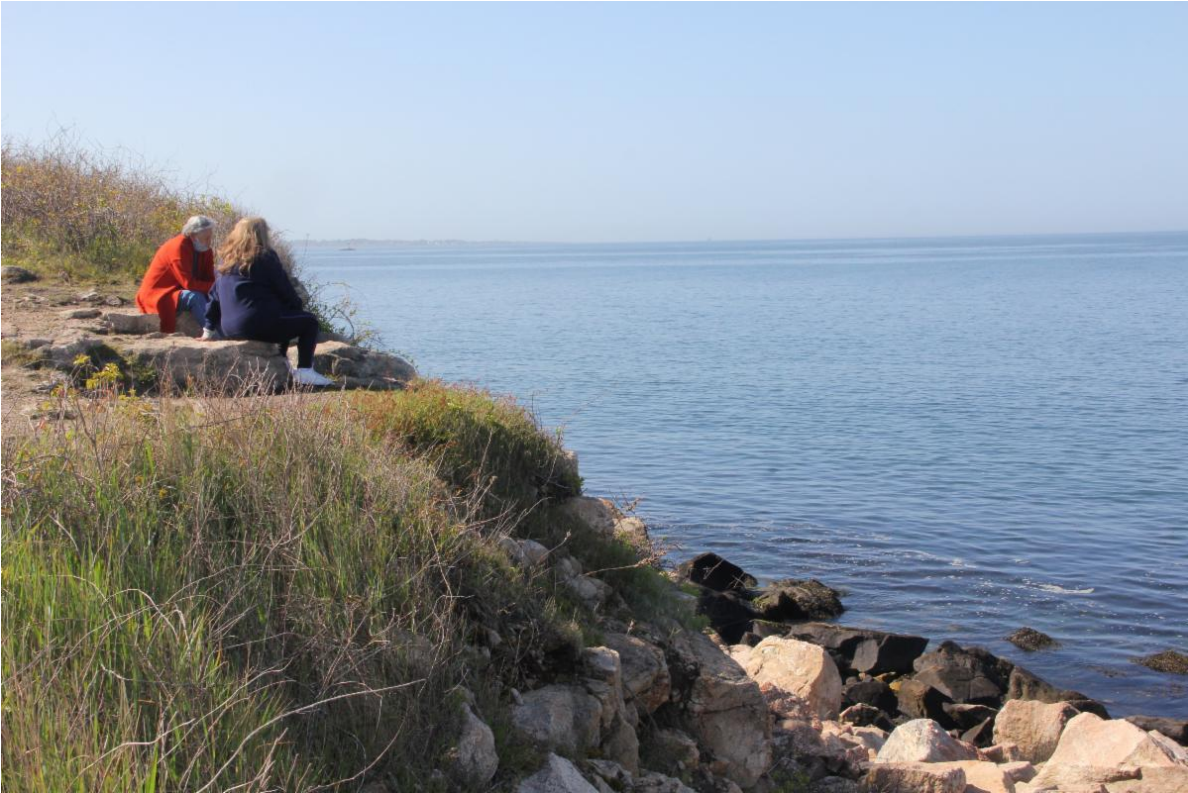
Visitors overlook the Long Island Sound at Bluff Point