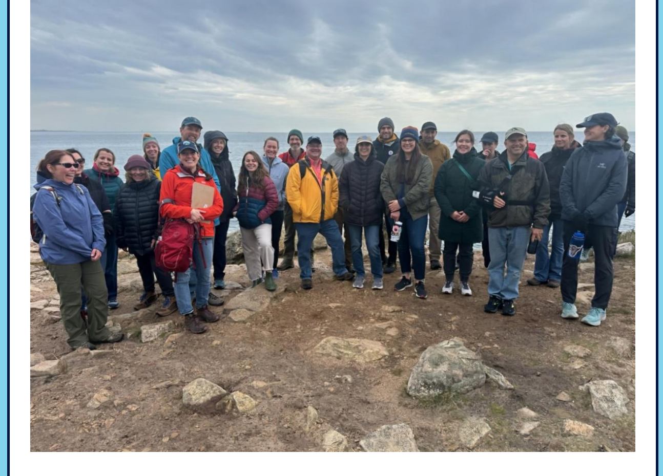
Northeast Reserve staff at Bluff Point State Park.